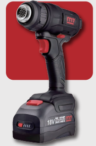
Cordless Heat Gun DHG-101