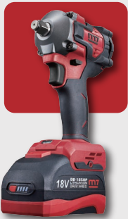
Cordless Impact Wrench DW-404