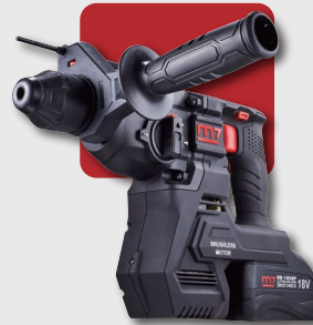
Cordless Rotary Hammer DRH-101