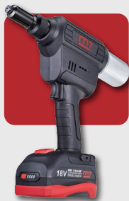
Cordless Rivet Gun DR-102