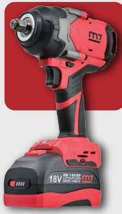
Cordless Impact Wrench DW-406