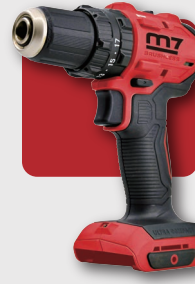
Cordless Drill Driver DD-102