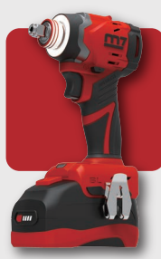
Cordless Impact Driver DS-203