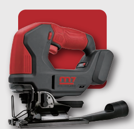
Cordless Jig Saw DJS-102