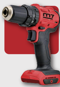
Cordless Hammer Drill Driver DH-102