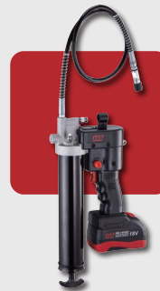
Cordless Grease Gun DGG-102