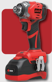
Cordless Impact Driver DS-202