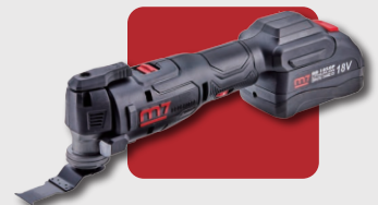
Cordless Oscillating Multi-Tool DOM-101